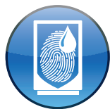
KeyOS MultiMark Server